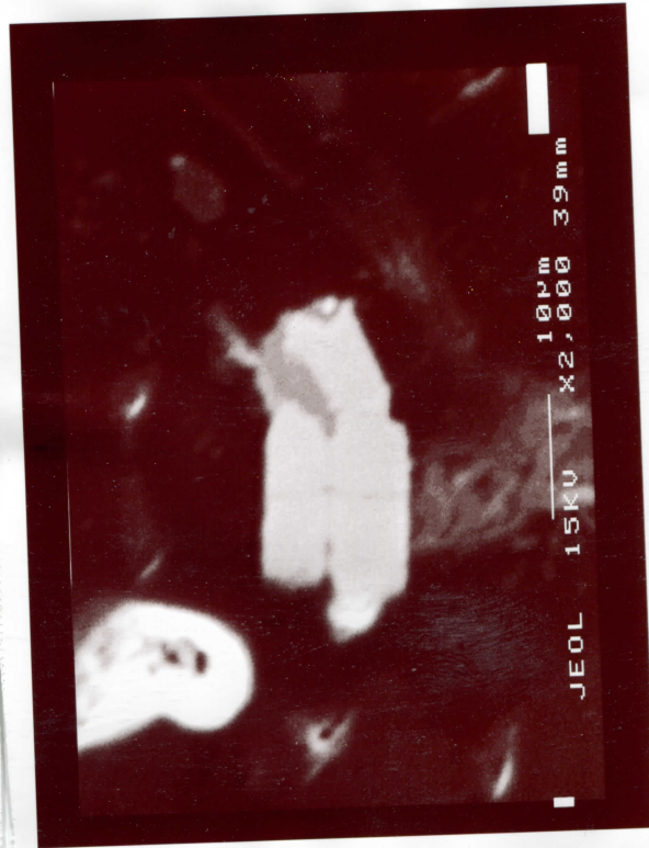
H.) C-g1 Rad