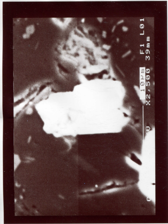
121129 HTC2g 15.) H 91