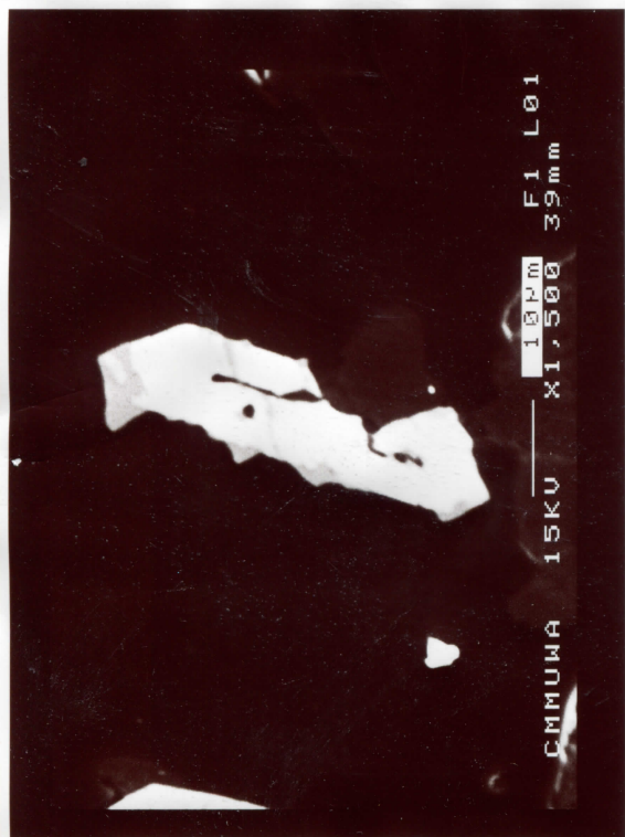
121126 HTC2g 4b.) I 91