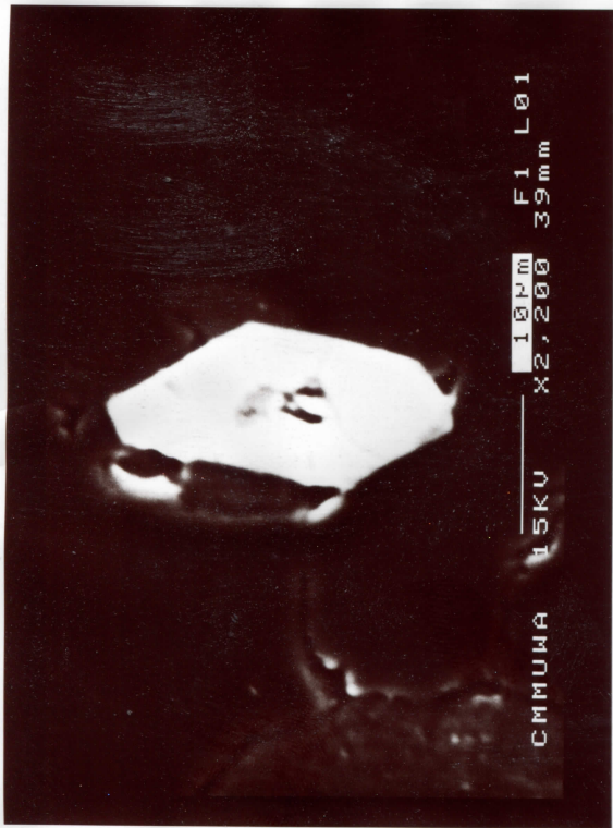
121125 HTC2g 4a) I 91