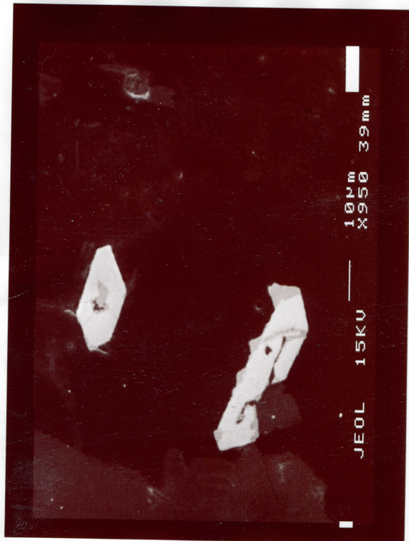
I.1 C-91 Bad