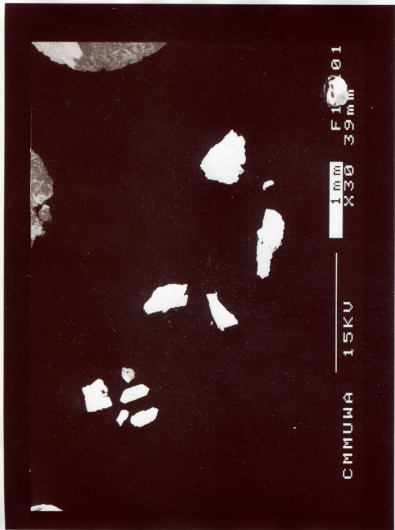
121132 C-91 Standards