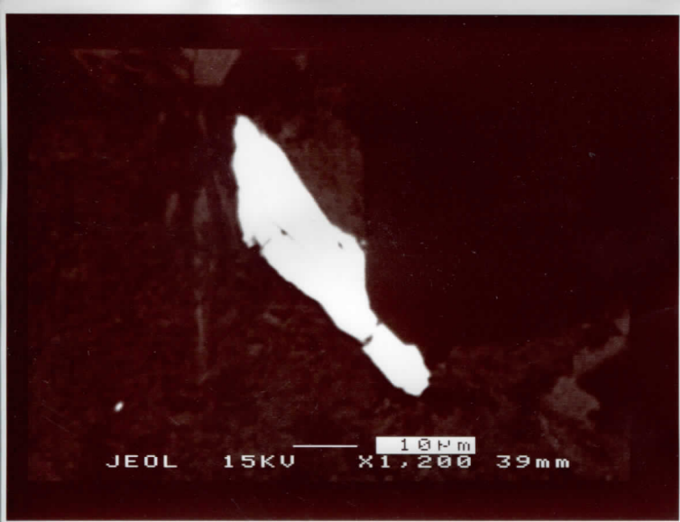
48102 3.) Rad