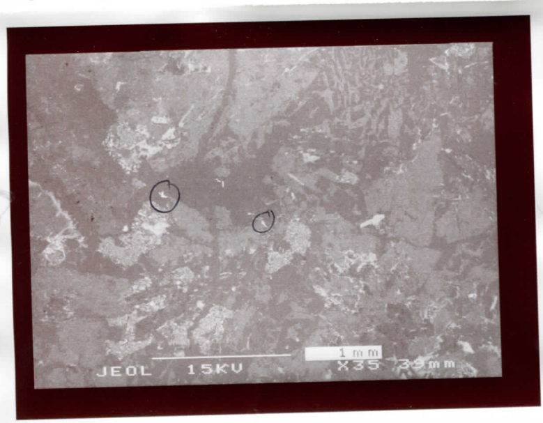
48102 3.) + 4.)