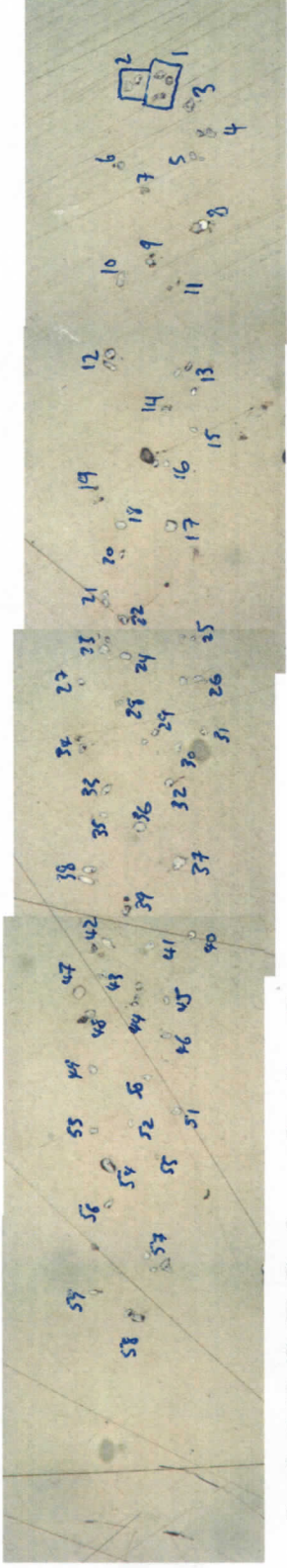
L465959 batch 1