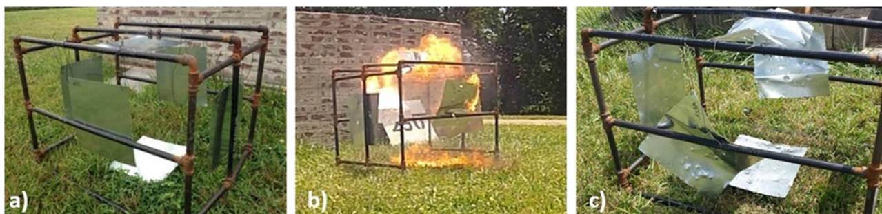
Fig. 2. Photographs of the PVC pipe bomb trial set-up, (a) prior to; (b) during; and (c) following initiation of the device.

Relative peak area recoveries of the three target components from each witness plate are provided in Table 5. An example chromatogram is presented as Fig. S2 in the electronic supplementary information. The relative quantities of nitroglycerin